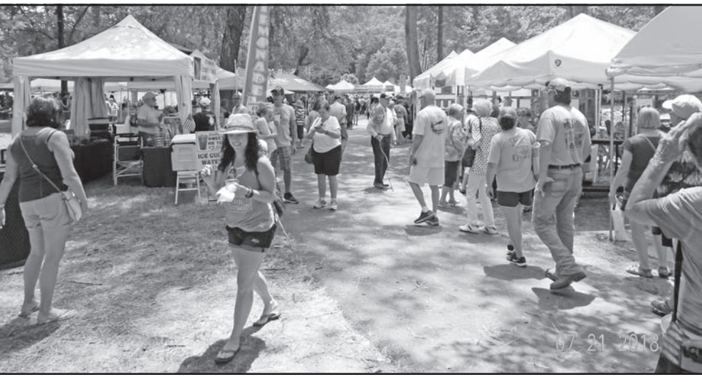
Butternut Creek Festival at Meeks Park in 2018.

The Annual Butternut Creek Festival is going to be held at Meeks Park on July 17th and 18th, and the High Country Artisans are excited to be bringing this event back to Blairsville. The Covid Virus caused many shows, including ours to be cancelled last year because we felt we could not provide a safe environment for both our attendees and artisans. We are working hard to make sure this year's festival will be one that everyone will