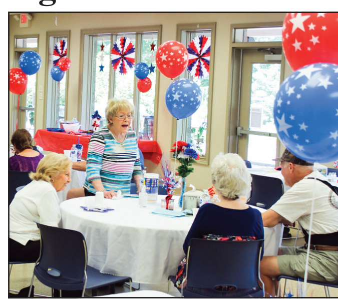
It was a joyful reunion Towns County seniors made a triumphant return to the Senior and celebration featuring food, Center in last week's grand re-opening following COVID.