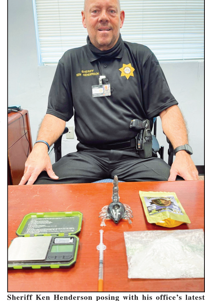
haul, including a bag of meth and scorpion-shaped drug paraphernalia.

Inside 2 Sections 16 Pages Arrests Church 4B Classifieds 6B Opinion 4A 5B 2B Oblis Sports